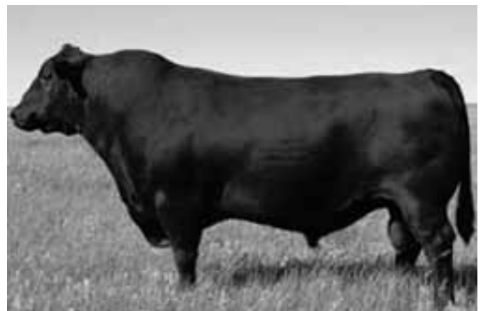
K C F BENNETT TOTAL