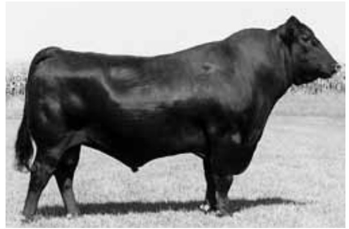
BON VIEW NEW DESIGN 878

A young open heifer from Sheridan Pope at Chandler Drive Angus Farm in Bristol, VA. She is a member of the Beauty cow family. Her sire is a son of the ABS breed legend Bon View New Design 878. Sells open, ready to breed to the bull of your choice.