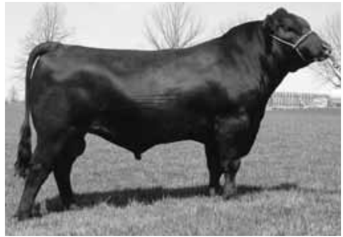
ALC BIG EYE D09N

Consignor: GREENWOOD ANGUS A daughter of the very popular Select Sires bull ALC Big Eye D09N out of a dam by the maternal specialist BAR EXT Traveler 205. She is from the Miss Burgess cow family. Sells open.