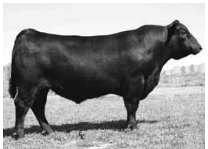
SITZ UPWARD 307R