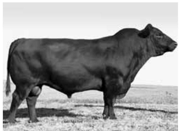
B C C BUSHWACKER 41-93