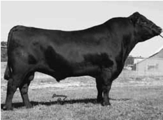
G A R YIELD GRADE

A granddaughter of the Select Sires bull Bon View New Design 208 who is known for his great female progeny. Notice +29 for milk. Sells open ready to breed.