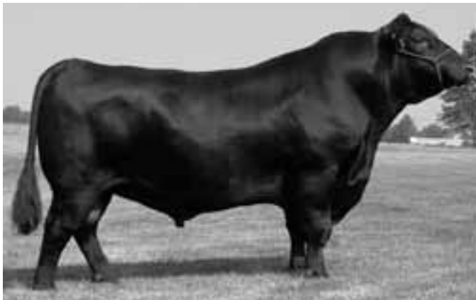
G A R PREDESTINED