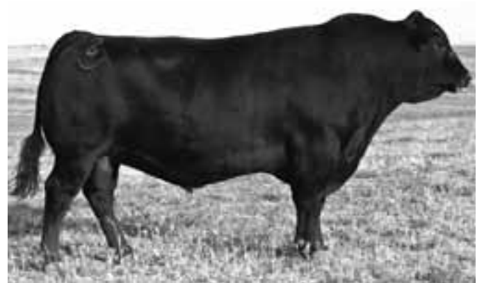
SITZ NEW DESIGN 458N