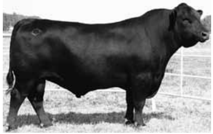
MYTTY IN FOCUS