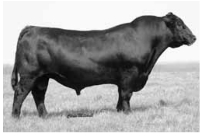
LEMMON NEWSLINE C804