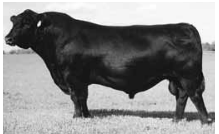
Boyd New Day 8005